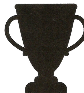
Youngstown Area Community Cup